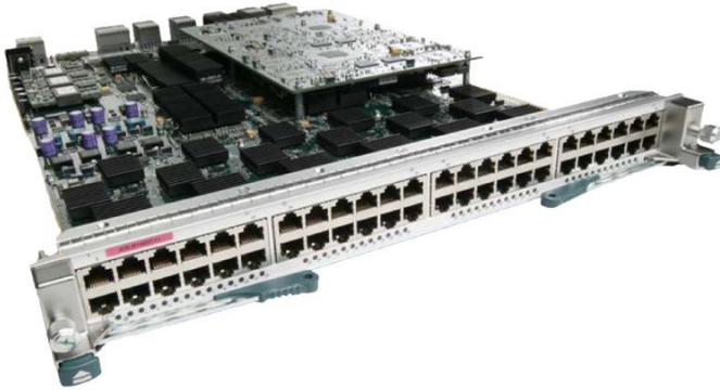
Figure 2. Cisco Nexus 7000 M1-Series 48-Port Gigabit Ethernet SFP Module